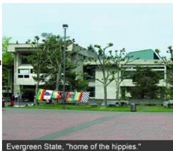
Evergreen State, "home of the hippies."

Mother Nature reigns supreme in the Pacific Northwest. Sure, the lumber companies have been trying for years to turn its beauty into napkins and newspapers, and there are the unnatural acts committed by the odd serial murderer--Ted Bundy and the Green River Killer were both particularly fond of the Cascade Mountains--but after mankind is done carving his mark on this particular part of the Earth, the forest is sure to swallow him up body and soul. This sense of permanence is perhaps one reason Washington is called "the Evergreen State."